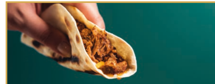
Chili with meat ground beef, beans, peppers, onions and spices Chili chipotle Smoked chili Taquera sauce Hot red sauce

De Carne Picada: soft wheat tortilla filled with chili picadillo, rice and cheese. Accompanied by beans, nachos, cheddar sauce | 16